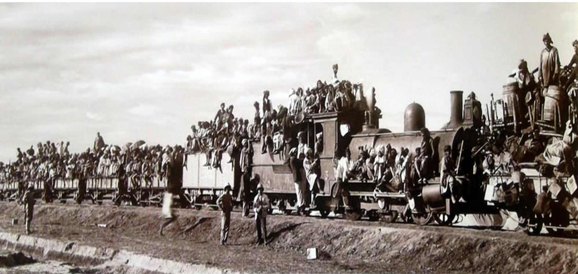
1897: Voi Station