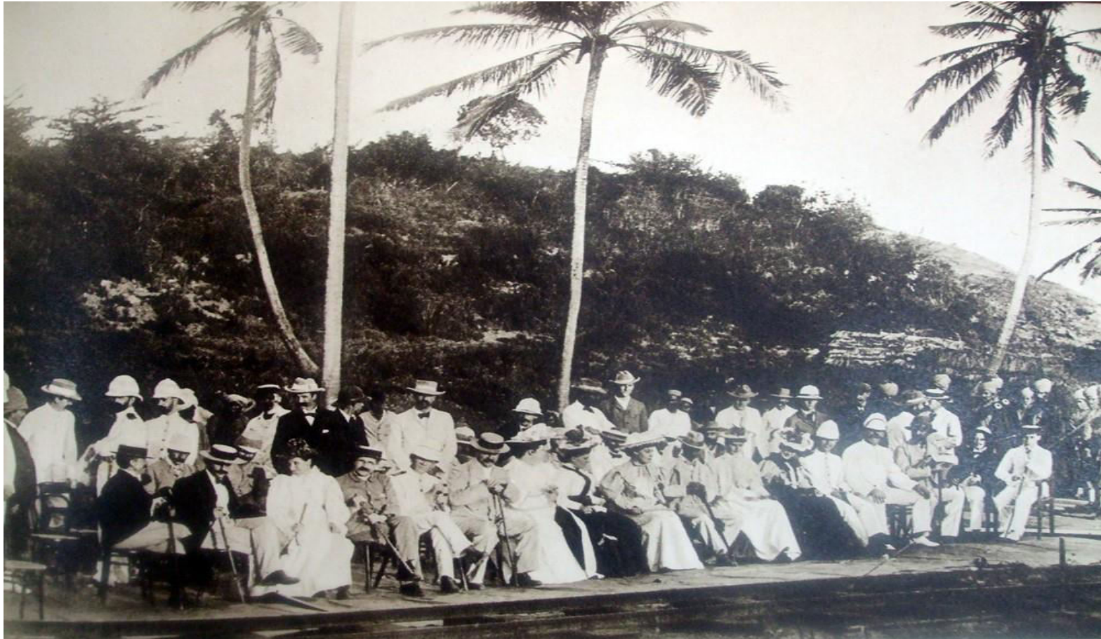
30 th May 1896: Official Plate Laying Ceremony