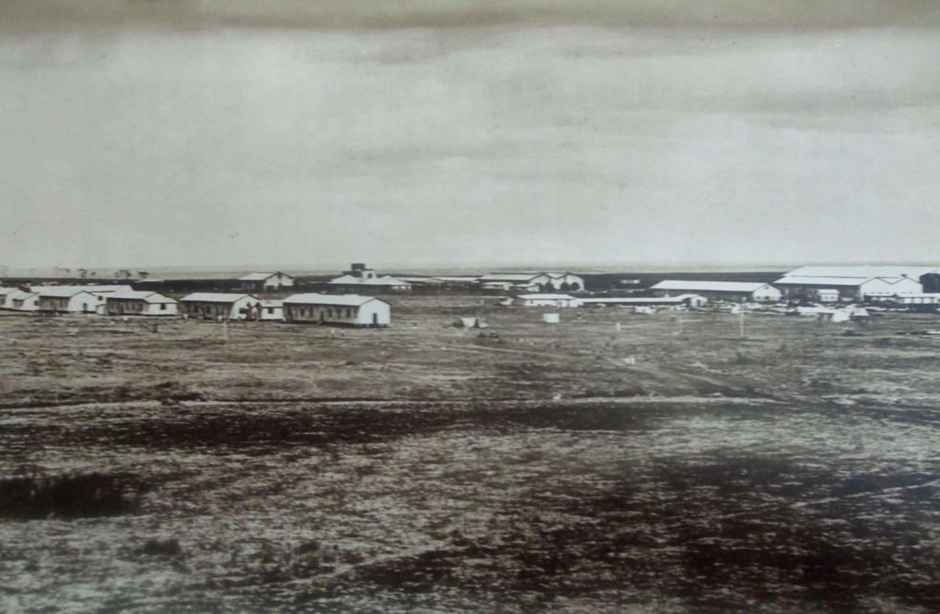
Old Railway Headquarters: 1898