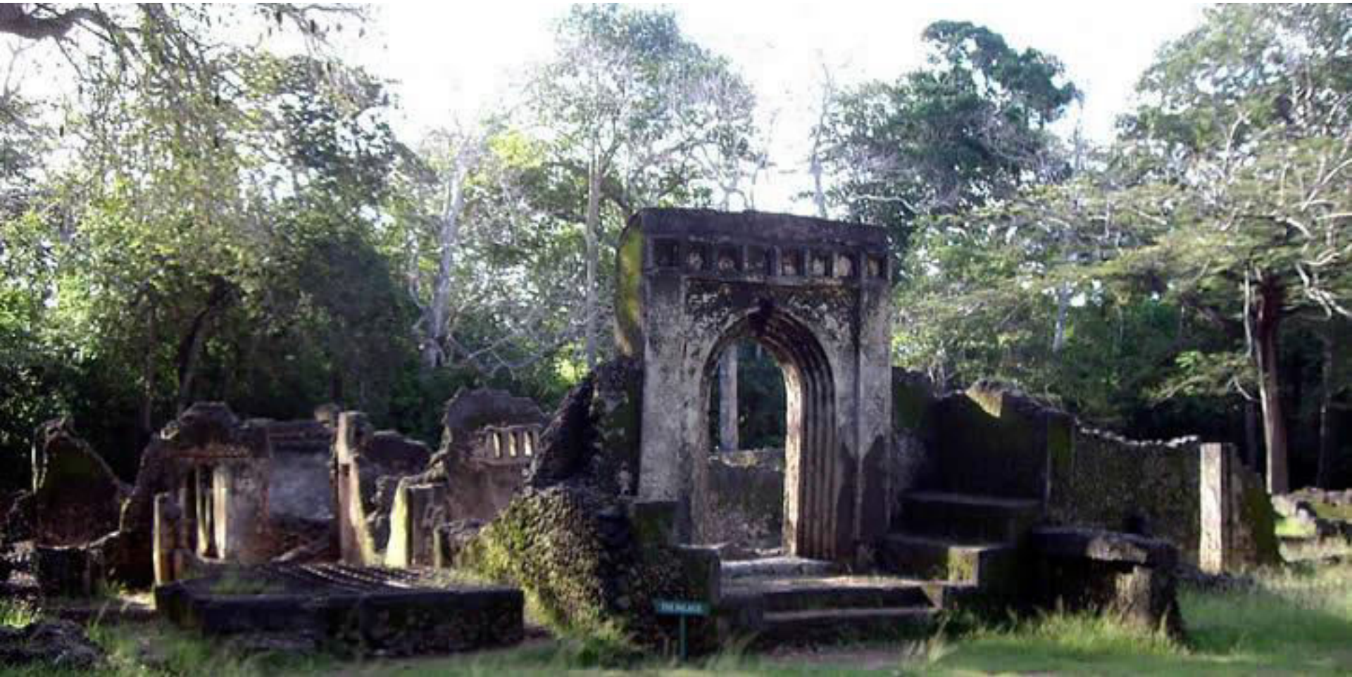
Gedi Ruins: Early 11 th Century