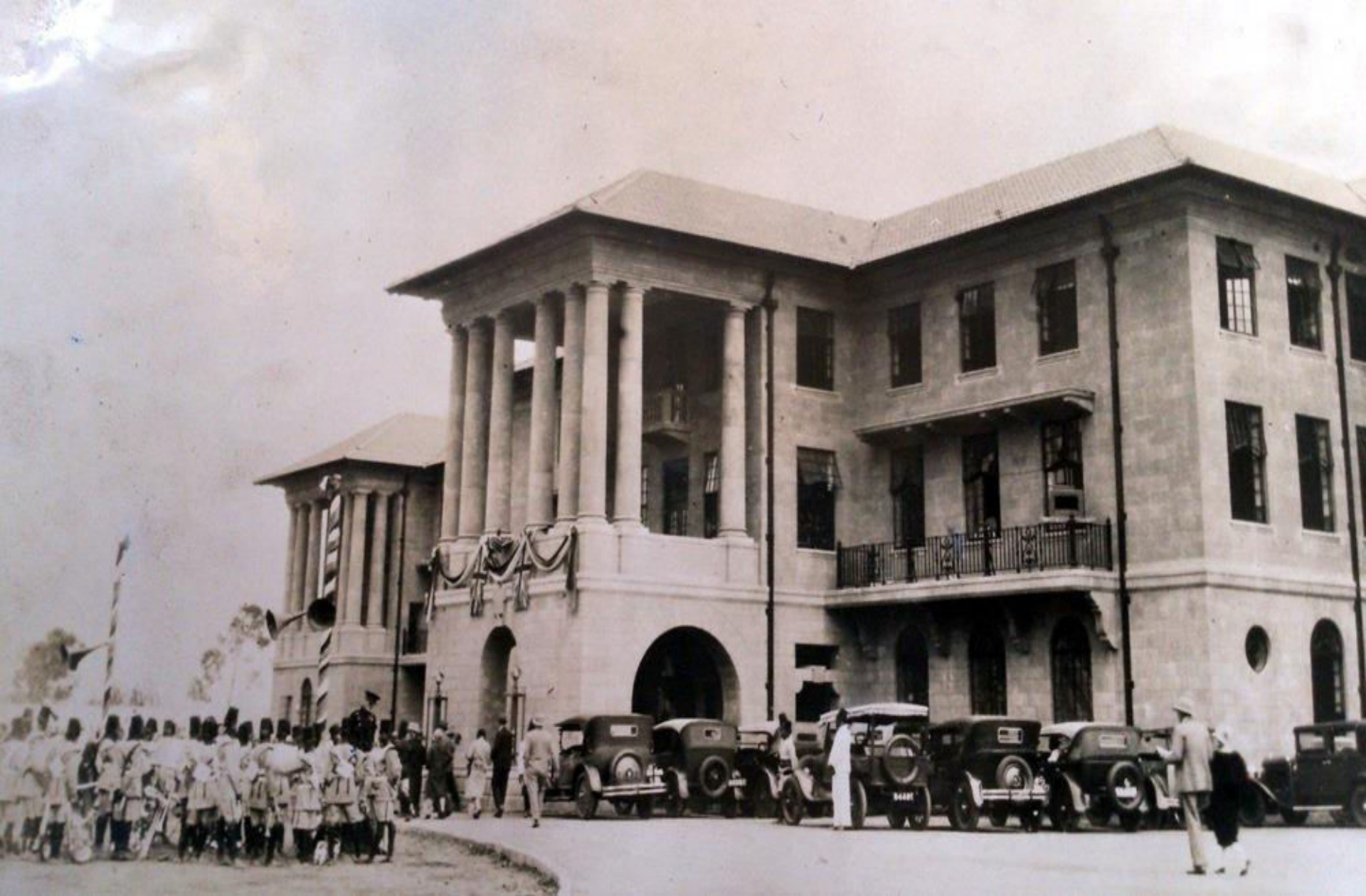
New Railway HQ: 1929